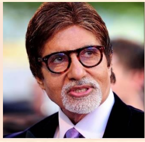
Shri Amitabh Bachchan Indian Actor