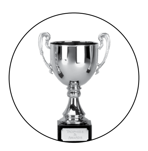
Academic Awards (Students)