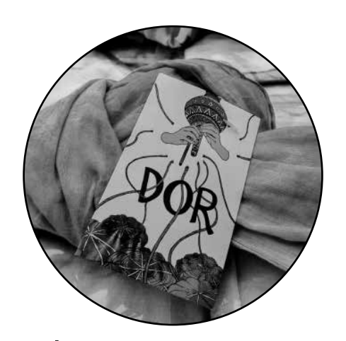
Student Empowerment Societies/ Cells