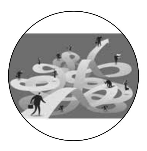
Crème de la Crème @ KMC