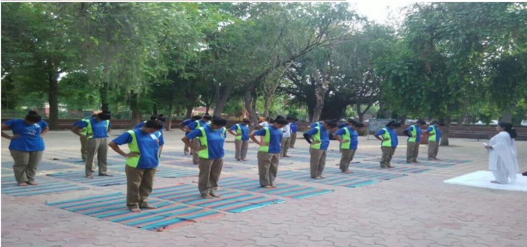
(Cadets attending the Yoga Session)

The Associate NCC Officer briefed the cadets about the International Yoga Day and benefits of yoga to the brain and mental health. A trainer was called upon wherein he talked about three practices of Yoga namely Gyan, Bhakti and Karma Yoga and also on the benefits of chanting of “AUM”.