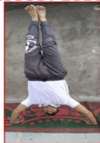
ADHO MUKHA VRKSASANA